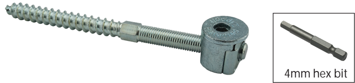
4mm hex bit